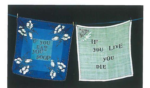
Deborah Colotti Lessons for My Son, 2000 linen, cotton, ink, clips, cord; 15" x 28" x 1"