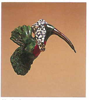
Nuala Creed Presidential Squadron, 2003 ceramic, wood; 72" x 6" x 6"