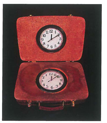
Peter Eller Travel Time I Suitcases, 2003 concrete, resin; 70" x 36" x 48"

Peter Hiers Lineage , 2003 wood, 78" x 12" x 9"