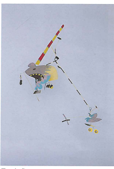
Timothy Rose 004 Mobile, 2003 painted sheet metal, wire; 36" x 24" x 24"

Vince Koloski Imprisoned Words, 2000 neon, etched acrylic, jail bars; 25" x 22" x 12"