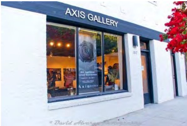
Axis Gallery

Axis Gallery is an artist-run space that was started in 1986. Members of this cooperative are equal partners and support the gallery through sales of artwork, labor contribution and monthly dues, allowing the gallery to function without the usual restrictions of commercial galleries. Besides exhibiting the work of Axis members, it displays invitational shows, exhibits by independent curators and the annual juried show.