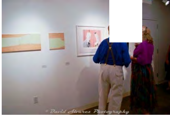
Axis Gallery

Many of the artists will be at Axis for the artists reception on the Second Saturday Art Walk this weekend. The reception will begin at 5 p.m. and will include the awards ceremony.