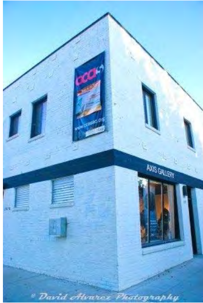
Axis Gallery

The Axis Gallery in Midtown hosted a preview reception for the sixth National Juried Exhibition Thursday. Works of art by over 25 artists will be on display until Aug. 28.