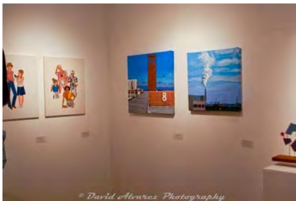
Axis Galler Liked this article? Share it with your friends